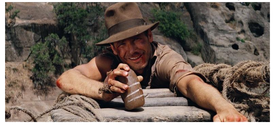
Still from Indiana Jones and Temple of Doom

After a week in UK, I traveled to Greece to visit some sites I desperately wanted to see, mainly in Athens and Crete. I was in the midst of some of the most iconic archaeological sites in the Mediterranean world, and they were