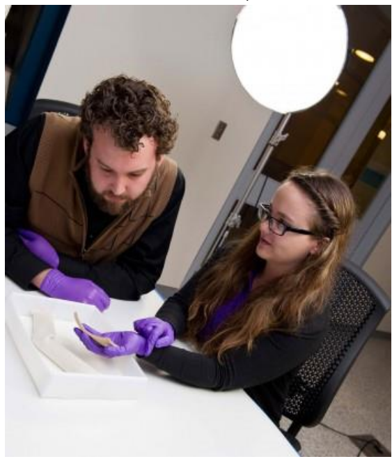
My colleague and I deciphering the meaning of this bowl.

For the first time, I was encountering a completely unknown object. The only accompanying information we had was a small museum card that stated that the potsherd may have been part of a larger Aramaic incantation bowl. In our graduate seminar, we were learning the scripts and dialects of Old and Imperial Aramaic (10th -6<sup>th</sup> century BCE). Aramaic incantation bowls, however, were written in a later dialect and script (6<sup>th</sup>-8<sup>th</sup> century CE). The writings and dialect of this later period were unfamiliar to me, and upon walking into the museum, I pondered how to unravel the mystery associated with this puzzle. Handling the object with my bright-purple nitrile gloves, I studied it, marveling at the cursive script, which reminded me of Arabic and Syriac (a dialect of Aramaic).