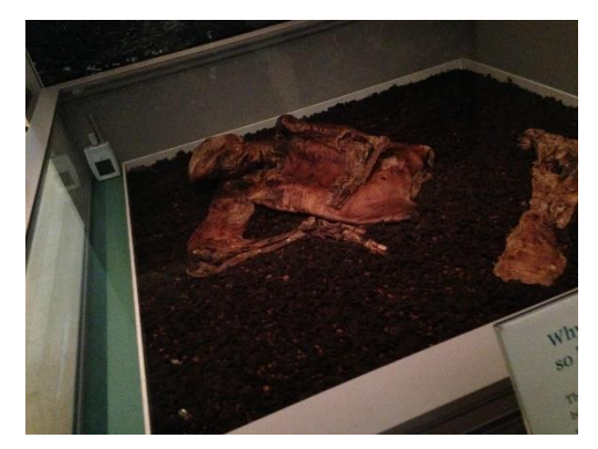
The Bogman in the British Museum

earlier in the summer, I entered a room filled with bookshelves, documents, and two long tables—upon which rested the four pieces I was to examine. After signing off on the pieces, the staff members returned to their own work and left me to study, with some silence, gloves, my camera, notebook, and pencil. Not to sound overly dramatic, I was overcome with awe in that room. This was real academic work. I was being allowed to conduct research in a museum. I got to touch artifacts that were over two thousand years old. In short, it was awesome!!!