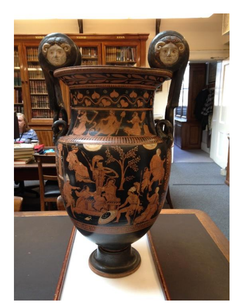
Volute Krater from Puglia, c. 370.

Tall, weatherworn lonic columns hold up a pediment with finely detailed characters who watch you as you walk toward the building. You hear the multilingual chatter of other visitors and compare this seemingly Roman temple with the Victorian lampposts that stand in the stone courtyard. You are impressed with the feeling of a universal temple of the Muses; and when you see the stately wooden staircase off to the side that leads to upper floors, that feeling does not fade.