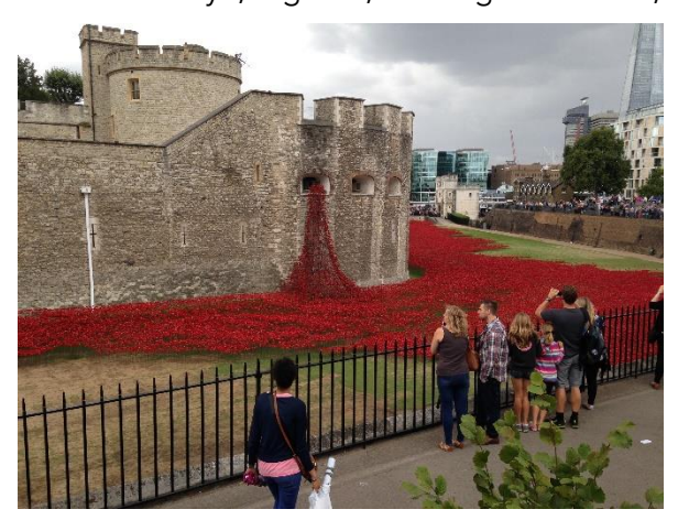
"River of Blood," Tower of London

The rest of my week in London was filled with more spectacular and amazing sights: the British Library with actual manuscripts from Da Vinci, Bibles written in Latin and Greek, the Magna Carta, and writings from the Beatles; the London Eye, Big Ben, Buckingham Palace, the Tower of London, the Sherlock Holmes Museum at 221B Baker