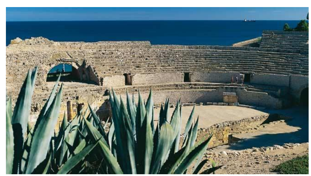
Roman Amphitheater, Tarragona (ancient Tarraco)

The UMBC Ancient Studies Department will conduct its 51<sup>st</sup> annual study tour in Spain, March 17-26, 2017. The price of $3,400.00 (based on a group of 30) includes all air and land travel, twin-share accommodation for eight nights at four-star hotels, eight buffet breakfasts, three dinners, two lunches, and entrance to all archaeological sites and museums on the itinerary. Single rooms are available at an additional cost. ANCS majors and minors, UMBC students, faculty, staff, alumni, and members of the community are invited to join us. The trip can be taken as a three-credit course in the Winter 2017 term (ANCS 301; winter semester tuition applies). Scholarships are available to Ancient Studies majors taking the course for credit. Places are limited, so reserve yours today! An initial deposit of $350.00 is due Monday, October 17, 2016 .