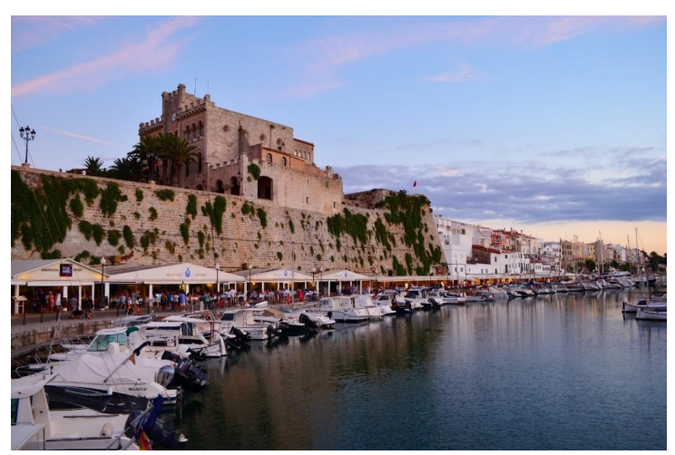
Citadel of Menorca, Spain

Today, a trip to the island might lead you to tour the fortified complexes of the Talayotic people or the bunkers carved into the cliff faces remaining from the Second World War. I found myself inhabiting two worlds: I spent my nights in Ciutadella, a small but lively modern town, which stood in sharp and remarkable contrast to my days spent working in the ancient "city of