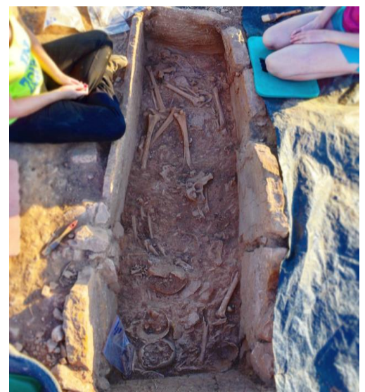
Tomb 353, Necropolis 4, Sanisera

The existence and proximity of the basilica and the mosque speak to the longevity of this relatively small settlement. Due to its location in the Mediterranean, Sanisera and its port (called Sanitja) supported important trade routes connecting various portions of Europe and North Africa. The importance of these routes is evidenced by the diversity and consistency of the site's use, which ranges from a Roman military occupation during the second century BCE to a British occupation in the modern era (1800s).