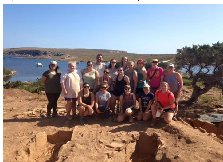
Sanisera Field School Session 08 Necropolis Team

Almost everyone is familiar with mayonnaise, a condiment consisting of egg yolks, lemon juice, and oil. But did you know that mayonnaise comes from Spain? I didn't, and this wonderfully obscure little fact is the perfect introduction to my three-week stay on Menorca. My hosts—the Sanisera International Field School (SIFS)—liked to tell us that the condiment, which is credited to a French chef, is named after Mahòn, the capital of Menorca. Known for mayonnaise, gin, natural parks, Talayotic culture, and the ancient city of Sanisera, Menorca is one of five Balearic Islands located off the coast of Spain. During the course of my trip, I stayed in the picturesque vacation town of Ciutadella, located opposite of Mahòn, and I studied in Sanisera, located near Cap de Cavallería at the northernmost point of the island.