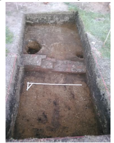
Foundation from Port Tobacco

Another objective of our excavation is to expand our knowledge of the town landscape. Is the neatly oriented town plan depicted on the Barbour map accurate or is the town plan colored by his memories of a distant childhood? Was the town plan more of an organic development? Or both? Last December we expanded our research beyond the print shop and into the lawn between the shop and Stag Hall by placing a series of soil cores at ten foot-intervals. We encountered a feature in the approximate center of the yard that suggests the side street running between Stag Hall and the print shop is still in situ under the lawn. This spring we plan to excavate at least one more unit in the print shop, then move over to the road area to test the results of the coring.