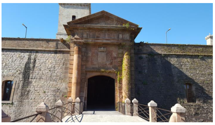
Entrance to the Fortress at Montjuic

While I absolutely loved wandering the streets of Barcelona and learning about the history of northern Spain, my favorite part of the trip was visiting the remains of the Roman settlement Augusta Emerita.