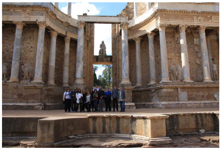
Theater at Mérida

We returned to Madrid that afternoon, once more driving through the wide, picturesque countryside of central Spain. Our bus driver, who also drove tour buses through the capital, gave us one final sweeping look at the majestic city. We got a lovely look at the Royal Palace and the striking Catedral de la Almudena, but perhaps the best last treat was the unexpected Egyptian temple of Debod, a gift to Spain from Egypt on the occasion of the building of the Aswan Dam in the 1960s. Then it was back to the hotel, and to one last evening in Madrid, more magnificent food, and for several of us, the heart-pounding enjoyment of a live Flamenco performance. We danced our way back to our beds, and then left, richer in spirit, brighter in mind, and perhaps a bit wider in waist, for the United States.