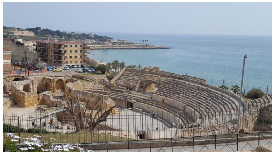
Roman Amphitheater at Terragona

and, most fascinating of all, the remains of the late Roman walls. Here, as residents feared the approaching Visigoths, they had reused pieces of architecture and even sculpture to make thick walls in a vain attempt at defense. We also visited the Picasso museum, which