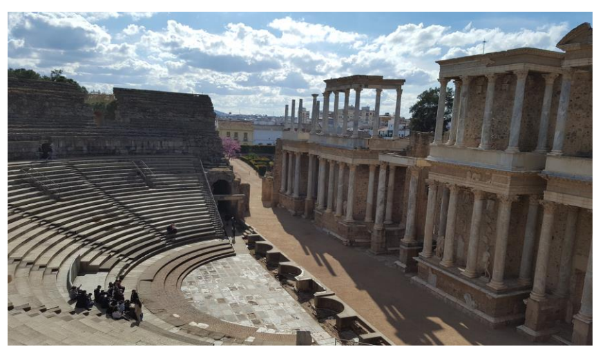
Cavea of the Theater at Mérida

Augusta Emerita, or Mérida as it known today, was a significant economic and political center for the Romans. It has since become a popular tourist destination because it possesses a Roman theater, amphitheater, Temple to Diana, an aqueduct and a bridge. It was declared a world heritage site in 1993 because it contains some of the best-preserved Roman architecture in the world. As we