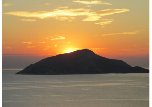
Sunset from Cape Sounion in Attica

The UMBC Ancient Studies Department will conduct its 52<sup>nd</sup> annual study tour in Greece, March 16-25, 2018. The cost (still to be determined) will include all air and land travel, twin-share accommodation for eight nights at four-star hotels, eight buffet breakfasts, three dinners, two lunches, and entrance to all archaeological sites and museums on the itinerary. Single rooms are available at an