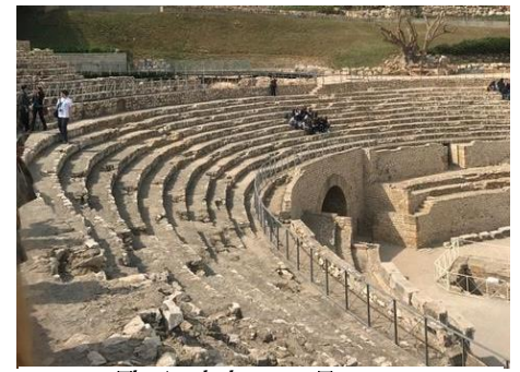
The Amphitheater in Tarragona

Plague, and is still in use today. While some of the Roman ruins (such as the amphitheater) were set off from the rest of the town with fences and walls, the remains of circus, built into later structures, were visible when walking among the everyday shops. There was even an elementary school that overlooked the amphitheater. I can't imagine looking out from history class, and being able to see actual ancient history. We had